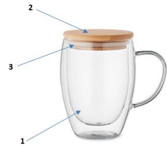
1, 2, 3 : direct food contact