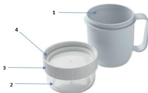
1, 2, 3, 4 : direct food contact

The following substances subject to restrictions and/or specification are used in the above-mentioned product. The materials and raw materials used comply with Regulation (EU) No 10/2011.