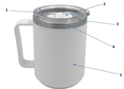
1, 2, 3, 4 : direct food contact

The following substances subject to restrictions and/or specification are used in the above-mentioned product. The materials and raw materials used comply with Regulation (EU) No 10/2011.