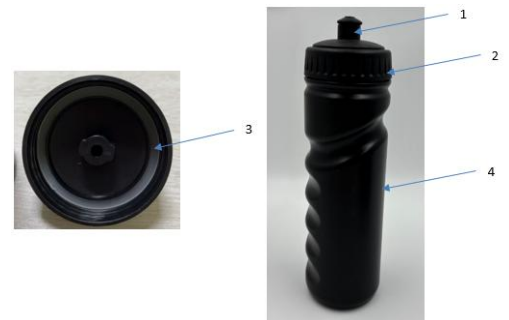
1, 2, 3, 4 : direct food contact

The following substances subject to restrictions and/or specification are used in the above-mentioned product. The materials and raw materials used comply with Regulation (EU) No 10/2011.