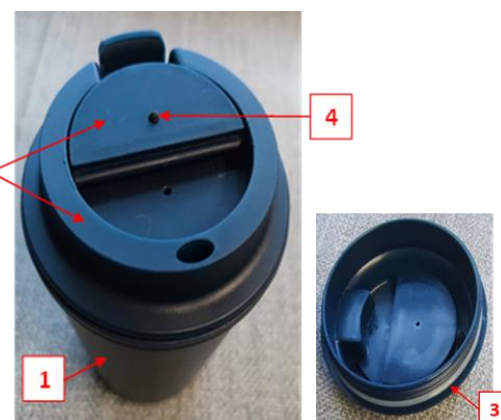
1, 2, 3, 4: direct food contact

The following substances subject to restrictions and/or specification are used in the above-mentioned product. The materials and raw materials used comply with Regulation (EU) No 10/2011.