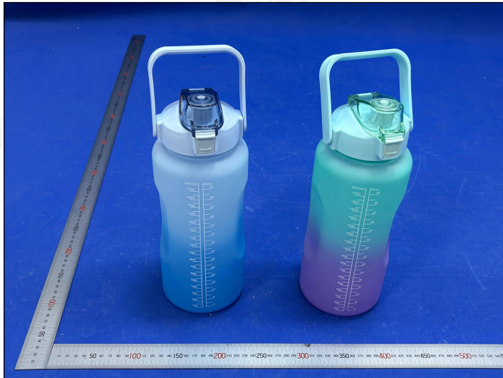
Product Photo, For reference only