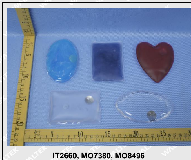
IT2660, MO7380, MO8496