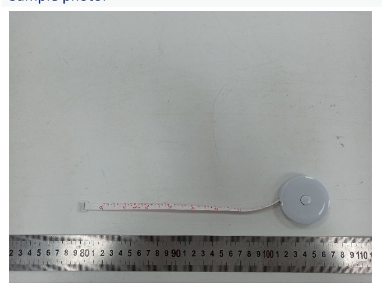
End of the report

The test result(s) and conclusion(s) in this report relate only to the sample(s) as received and the method /regulation section(s) tested as described herein. If it is not further specified in the report, the decision rule for stating conformity is based on the QIMA decision rule. (<a href="https://www.qima.com/conditions-of-service#decisionRule">https://www.qima.com/conditions-of-service#decisionRule</a> ). This test report may not be reproduced in whole or in part, without the written approval of QIMA (Hangzhou) Testing Co., Ltd.