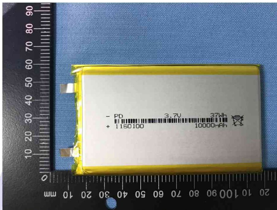
Photo 1 Front 正面