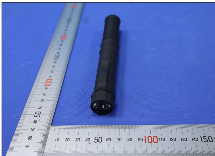
Test Sample Photo